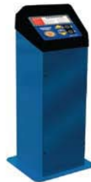
SP-7X Power Console