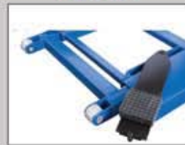
Automatic Safety Locks