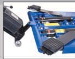
MD-6XP Power Unit Cart

The design, material and specifications are subject to change without notice.