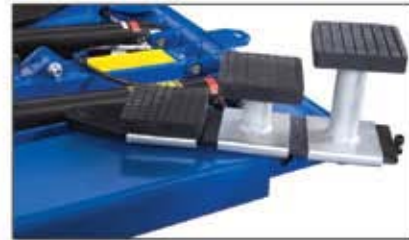
Standard Pad Adapter Kit on MD-6XP