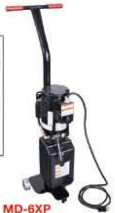
MD-6XP Power Console